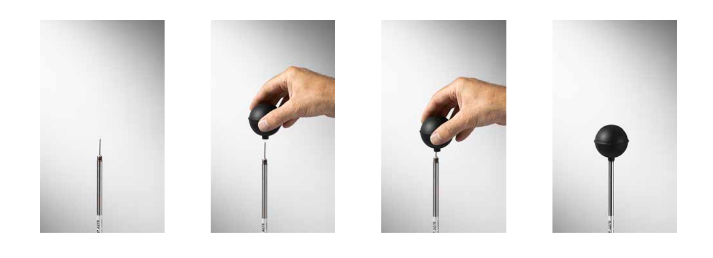
<sup>(**)</sup> Response time T<sub>95</sub>

Globe thermometer probe Ø=50 mm (TP3276.2), Ø=150 mm (TP3275) Pt100 Sensor type: (*) Class 1/3 DIN Accuracy: -30 ÷ 120 °C Measurement range Connection: 4 wires plus SICRAM module Connector: 8-pole female DIN45326 Cable: Only TP3275 (2m) Stem dimension: Ø=8 mm L= 170 mm (TP3276.2), Ø=14 mm L= 110 mm (TP3275) 15 minutes