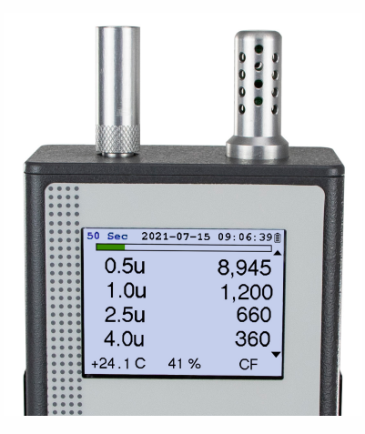
Scrolling Functionality Streamlines Sampling

Integrated Tools Menu to Optimize Device Capabilities